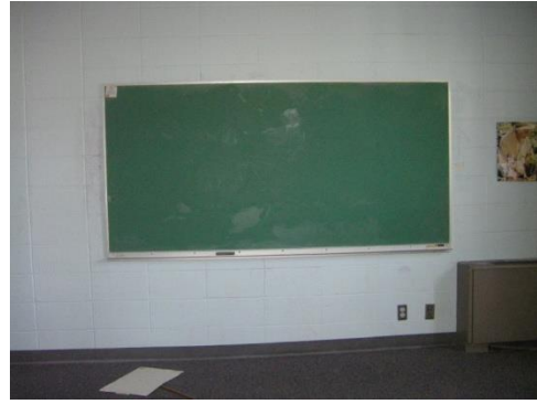
Chalkboards – Reuse