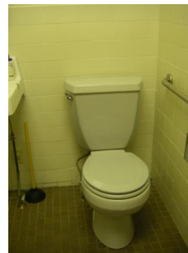
Toilets – Reuse