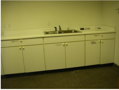
Kitchen sinks and cabinets – Reuse