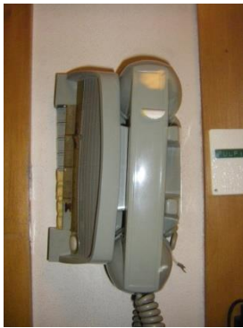
Vintage phones – Reuse