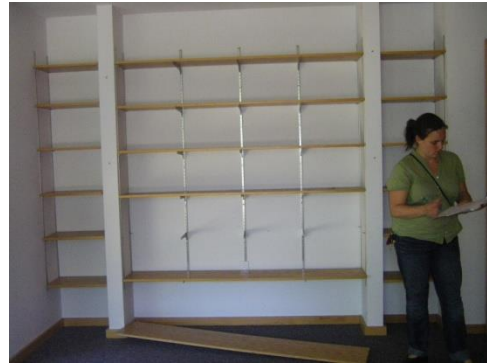
Interior doors, jams, and hardware - Reuse