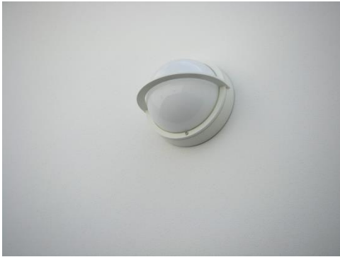
Light fixtures – Reuse