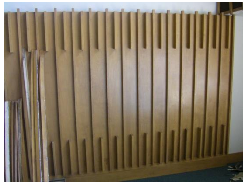
Wood paneling – Reuse